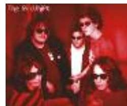
The Red Shift, one of the featured artists at the Black Horse Music Festival